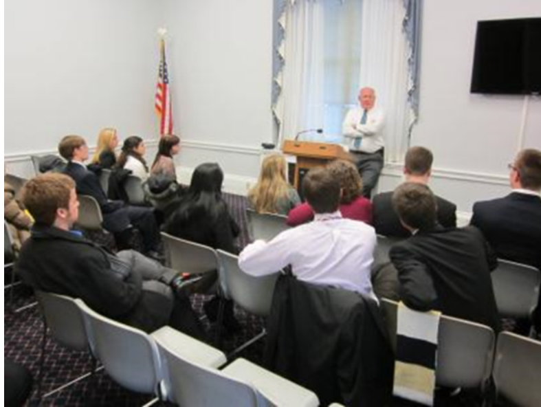
Representative Glenn Thompson speaks with the Juniata students in the Cannon House Office Building in Washington, D.C.