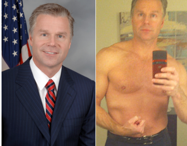
Representative Christopher Lee, R-NY, and the photo he submitted on Craigslist

More often than not, it seems to be Republican Representatives and Senators who find themselves in very embarrassing sexual situations. That's not to say that Democrats don't, for there have definitely been a fair share of them, but it seems the most embarrassing and ridiculous ones tend to be Republicans. Chris Lee actually took the smart path; as soon as the news broke, he immediately resigned instead of pretending it wasn't him or letting things drag on. This strategy worked out well. It was a topic for a week—he was “the Craigslist Congressman”—and then he went away. Others, like Newt Gingrich, will say condescending things about people and then months or years later we find out that they are doing all of the things about which they criticized others. Every time they talk about sexual immorality you can't help but think, “Yeah, but you're the one who has cheated on every wife you've had.” Or, “You're the one who engaged in gay sex and drugs with others.” Ted Haggard is a good example; although he is not a politician, he played a big part in the whole sexual morals debate. These people have the big mouths and tell you what to do, but in their private lives they do what they say no one else should be doing. It's ridiculous and hypocritical.