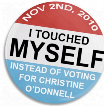
Christine O'Donnell Campaign Button, 2010