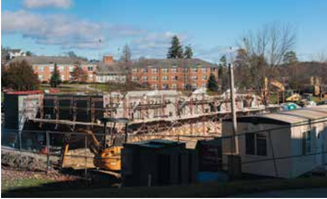
Construction scene of the Integrated Media and Studio Arts building

Since 2006, the College has frequently been named to the President's Higher Education Community Service Honor Roll, the highest federal recognition a school can achieve for its commitment to service-learning and civic engagement.