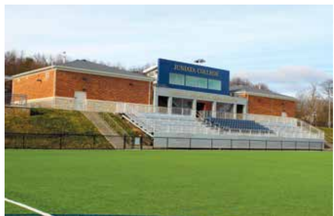
Winton Hill Athletics Complex

Juniata College takes positive steps to enhance diversity in both its community and its curriculum. The College commits to this policy not because of legal obligations but because it fully believes such practices are basic to human dignity.