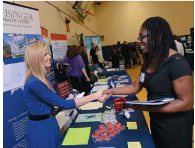
Juniata Career Day

residences) and an additional 10 off-campus houses. The College’s residential life program showcases Juniata’s heritage of Brethren values by incorporating peace, service, simplicity, and community into programming requirements.