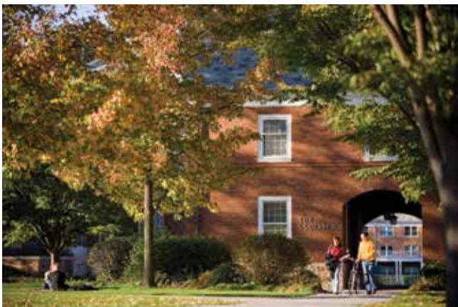
The Cloister residence hall

Juniata is located in the county seat of Huntingdon, Pa., along the Juniata River in the heart of south central Pennsylvania, a half-hour drive from State College to the north and Altoona to the west, and halfway between Interstate 80 and the Pennsylvania Turnpike. On the Baker-Henry Nature Preserve is the Baker Peace Chapel, designed by renowned architect Maya Lin. The Raystown Field Station provides one of the most distinctive opportunities in the nation to study environmental science. On campus, many impressive redbrick buildings surround a broad, open mall and quadrangle. Juniata students, faculty, and staff enjoy the beauty and functionality of a quintessential small college campus and the strong sense of community that characterizes the College.