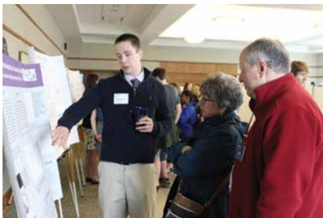
Students present research at the Liberal Arts Symposium.

Juniata is a residential college, and 82 percent of the degree-seeking student body lives in 19 College-owned facilities, which include nine campus residence halls (predominantly traditional style