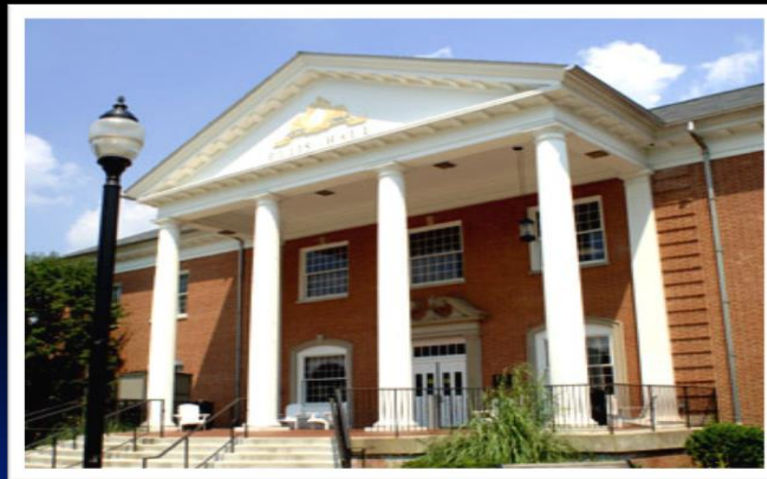
Ellis Hall: Home of Baker, Eagles Landing, Office of Student Activities, Community Service, Career Services, Post Office, Public Safety & the Bookstore