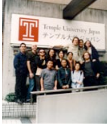
Students at Temple University Japan